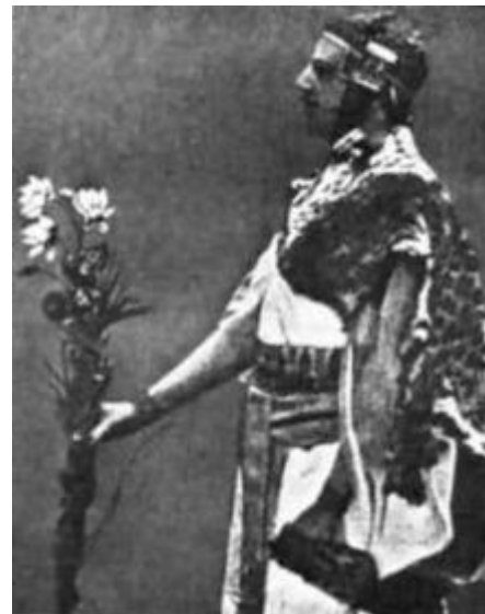
Samuel Liddell MacGregor Mathers in Egyptian setup performing a ritual in the Hermetic Order of the Golden Dawn