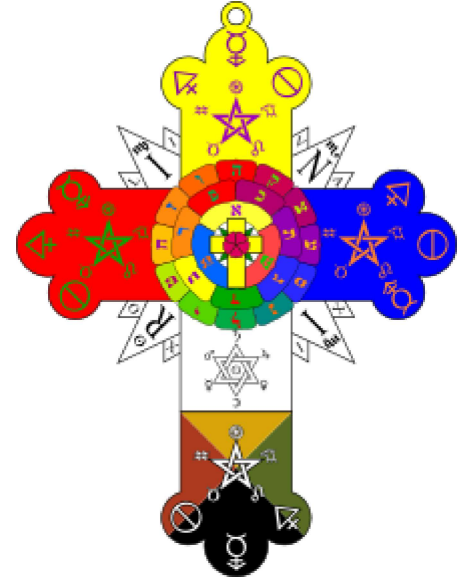
Rose Cross of the Golden Dawn.