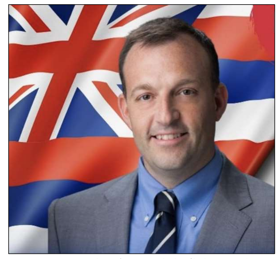
Figure 1: Hawaii Governor Josh Green's current Facebook profile photo, accessed August 16, 2023. <a href="https://www.facebook.com/DrJoshGreen/">https://www.facebook.com/DrJoshGreen/</a> | <a href="mailto:Backup File">Backup File</a>.

"I'm already thinking about ways for the state to acquire that land"