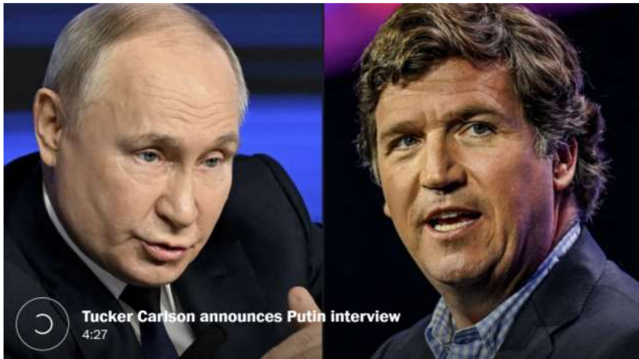
Photo: The Washington Post . Reproduced for educational purposes only. Fair Use relied upon.

Putin made direct reference to unseen forces running Biden and America.