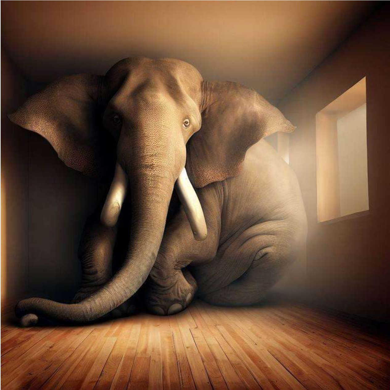
Photo: Saatchi Art. Reproduced for educational purposes only. Fair Use relied upon.